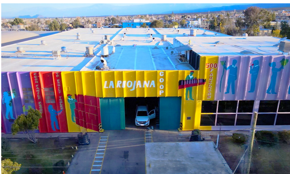
Newly painted mural on La Riojana's bottling plant