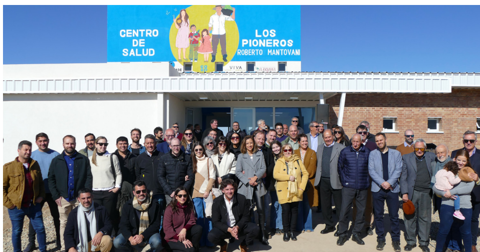
La Rioja co-operative members, their families and special guests gathered outside the health centre