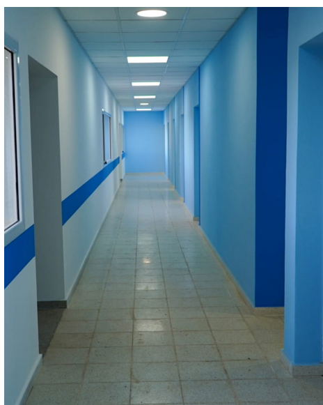
Interior shot of a corridor in the newly completed health centre