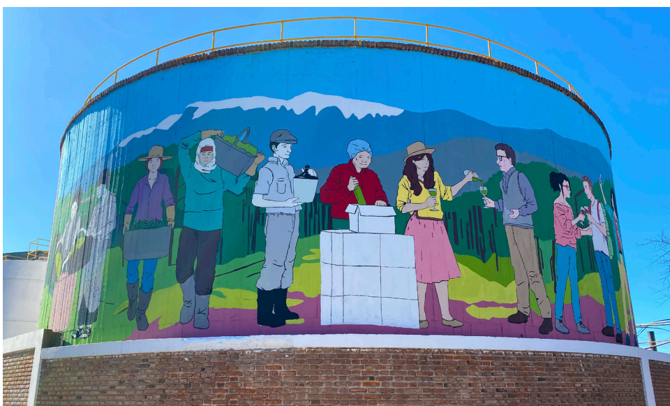
Newly painted mural on La Riojana's 60 year old wine tank