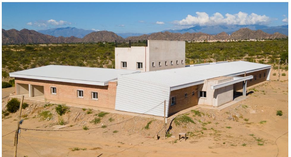
Side view of Los Pioneros Health Centre